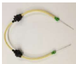
Connector 0,5 mm and 0,8 mm

Note: Pk's with 0,5 and 0,8 mm tubes have 3 connectors/tube.