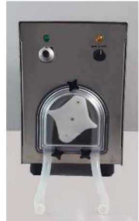
With 1500-2r Pump head

Portable model 1500-2r, with carrying handle and connector for car battery.