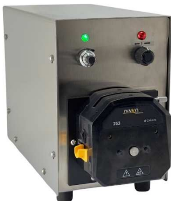
With 253-3r Pump head