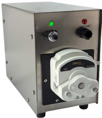
With 153-3r Pump head

Portable model 1500-2r, with carrying handle and connector for car battery.