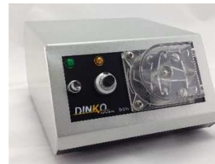
With 50-2r Pump head